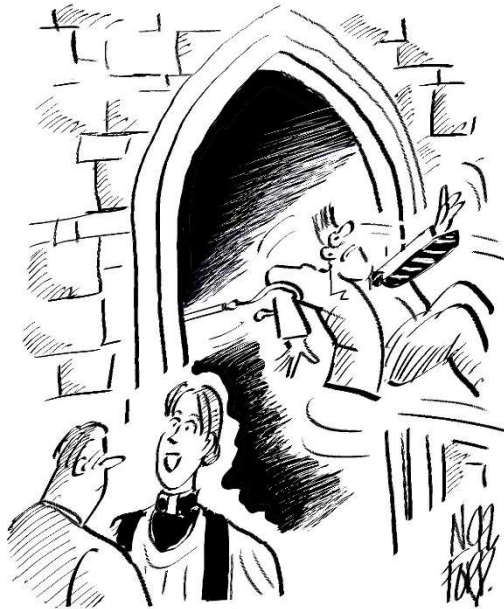
Our church warden is not letting people into the church just now