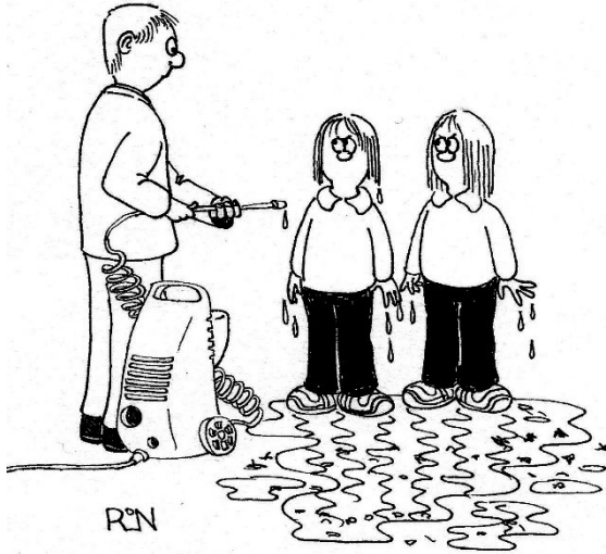
The twins had been doing Messy Church at home.